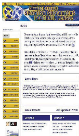
Scottish Supporters Football League Home Page

The newsletter will also be available to download as a PDF file from the news section of the website also.