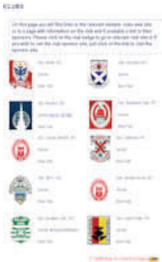
SSFL Club Page